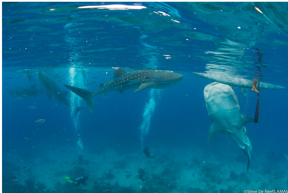
Whale shark getting fed in Tan-awan, Oslob over the shallow reef.

Study: https://link.springer.com/article/10.1007/s00267-018-1125-3